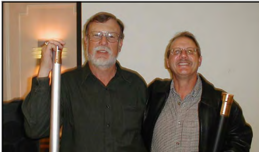
Present and Past Presidents with their new Kulick fly rods